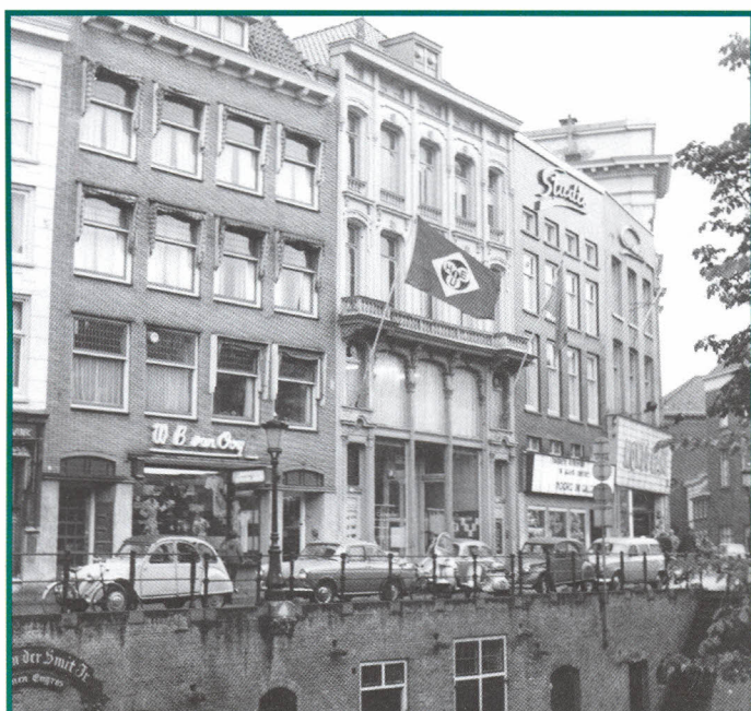
Building of the office of IHEU between 1957 and 1980

Besides the normal work regarding the archives of Dutch Humanists and Humanist organisations the activities of the HHC include historical research as well as of the Humanist movement in the Netherlands from circa 1856 (the founding of the Dutch freethinker movement) onwards. It also serves as a documentation centre for it. Furthermore it helps journalists, researchers, and makers of TV and radio programmes on questions regarding the history of Dutch Humanism.